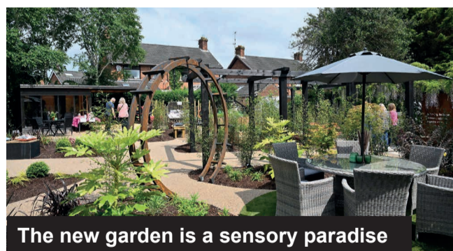
The new garden is a sensory paradise

The Abbeyfield Belfast Society (ABS) has celebrated the renovation of the garden at Bell Rotary House sheltered housing scheme in East Belfast.