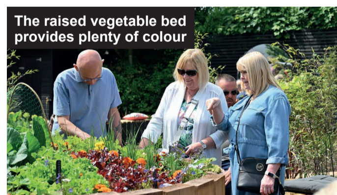
The raised vegetable bed provides plenty of colour

accessible outdoor space and summerhouse for everyone, enabling our residents to be more active, improving their mental and physical wellbeing.