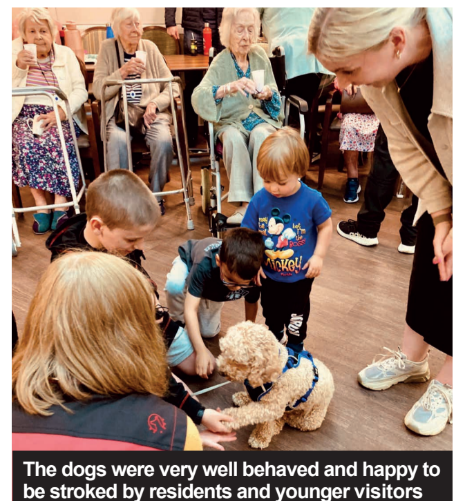
The dogs were very well behaved and happy to be stroked by residents and younger visitors